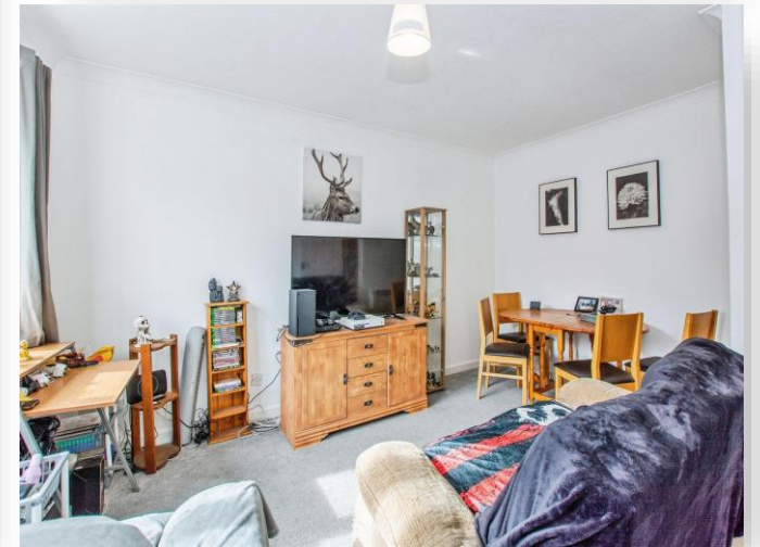
Mill Close, Wisbech, PE13 3BD