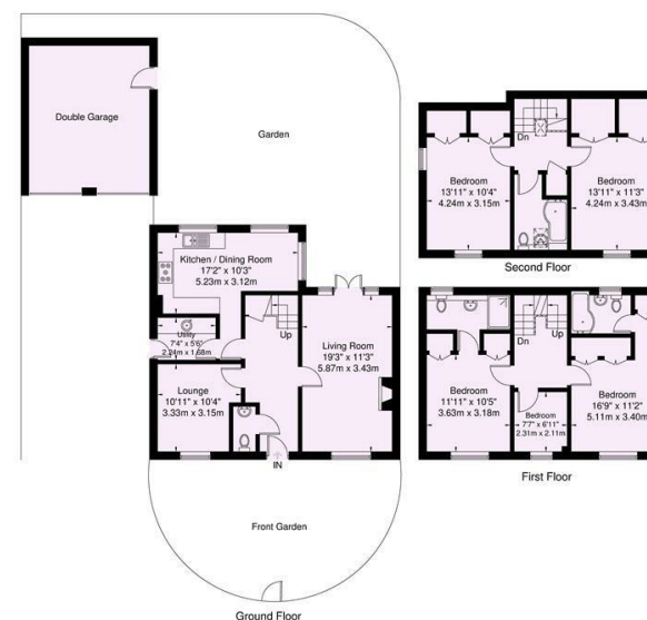
ILLUSTRATION FOR IDENTIFICATION PURPOSES ONLY ALL MEASUREMENT ARE MAXIMUM, AND INCLUDE WINDOW BAYS AND WARDROBES WHERE APPLICABLE THIS PLAN MUST NOT BE REPRODUCED BY ANY OTHER PERSON WITHOUT PERMISSION