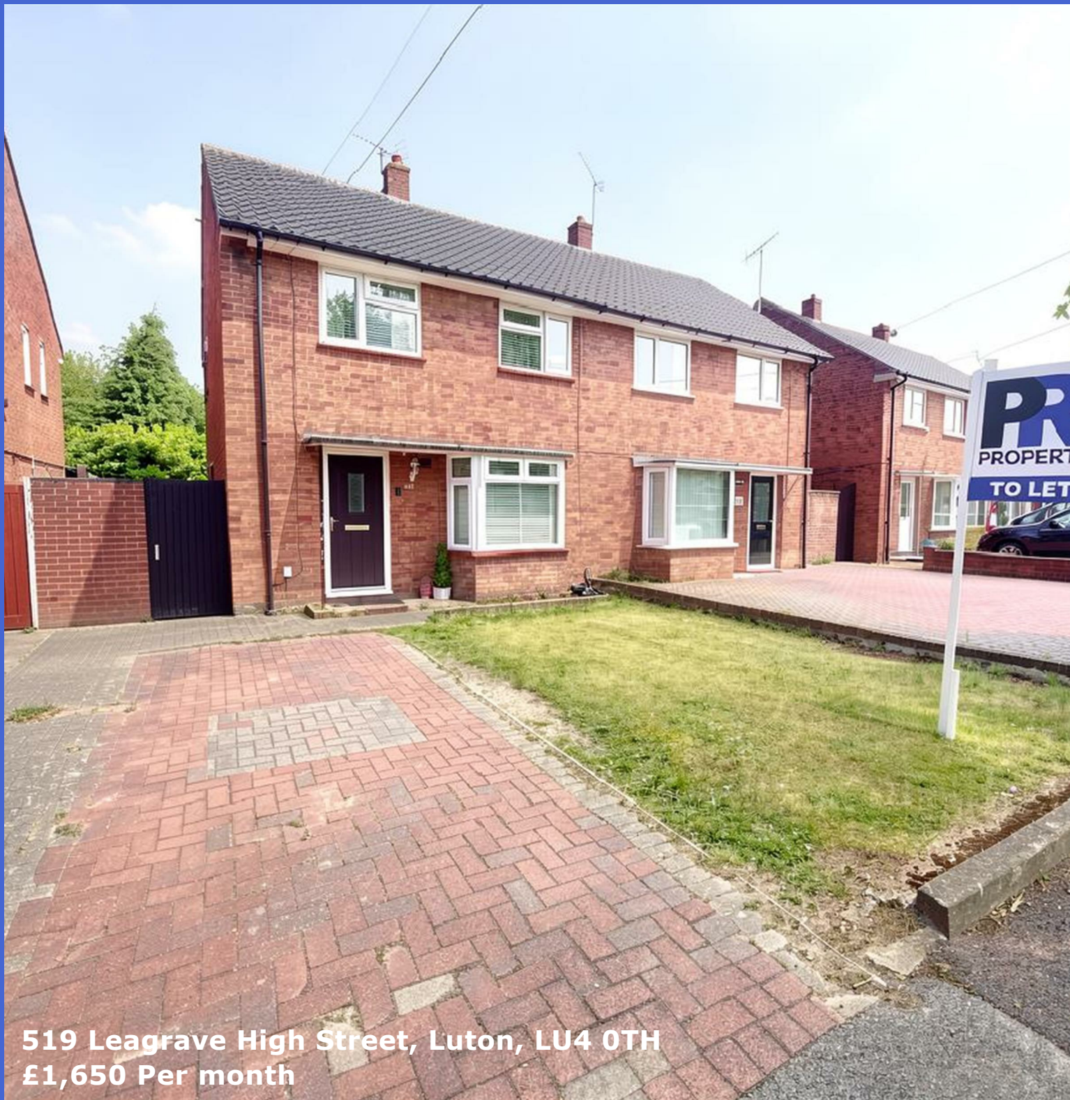
519 Leagrave High Street, Luton, LU4 0TH £1,650 Per month