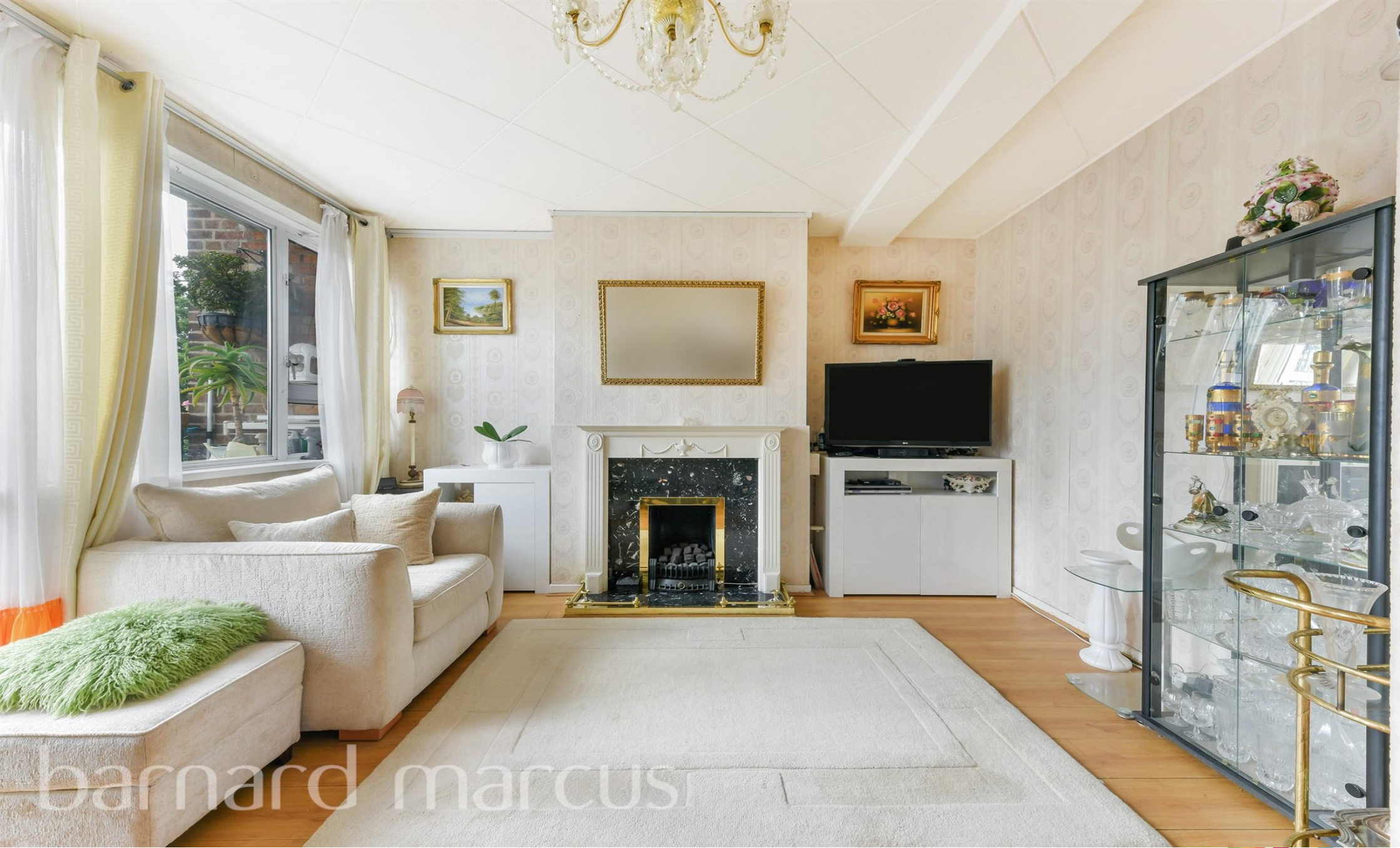
Martley House Patmore Estate, LONDON SW8 4HX