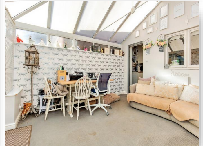
Manor Road, Stilton Peterborough PE7 3XA