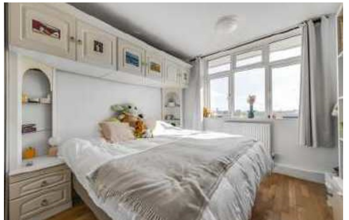
Notting Hill Gate, W11