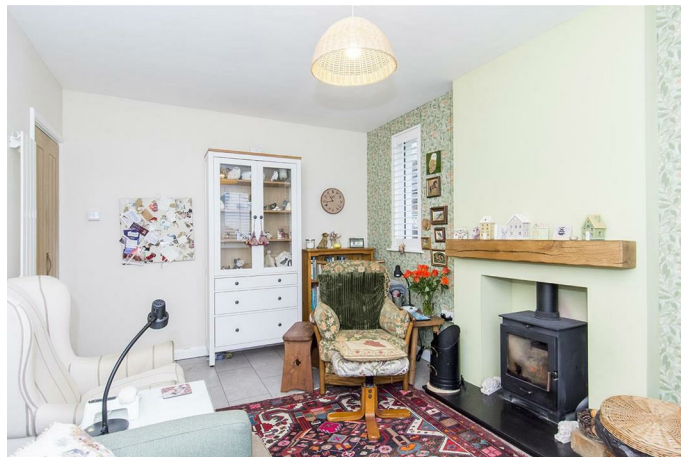
Bedroom One 12'4" x 10'1" (3.76m x 3.07m)