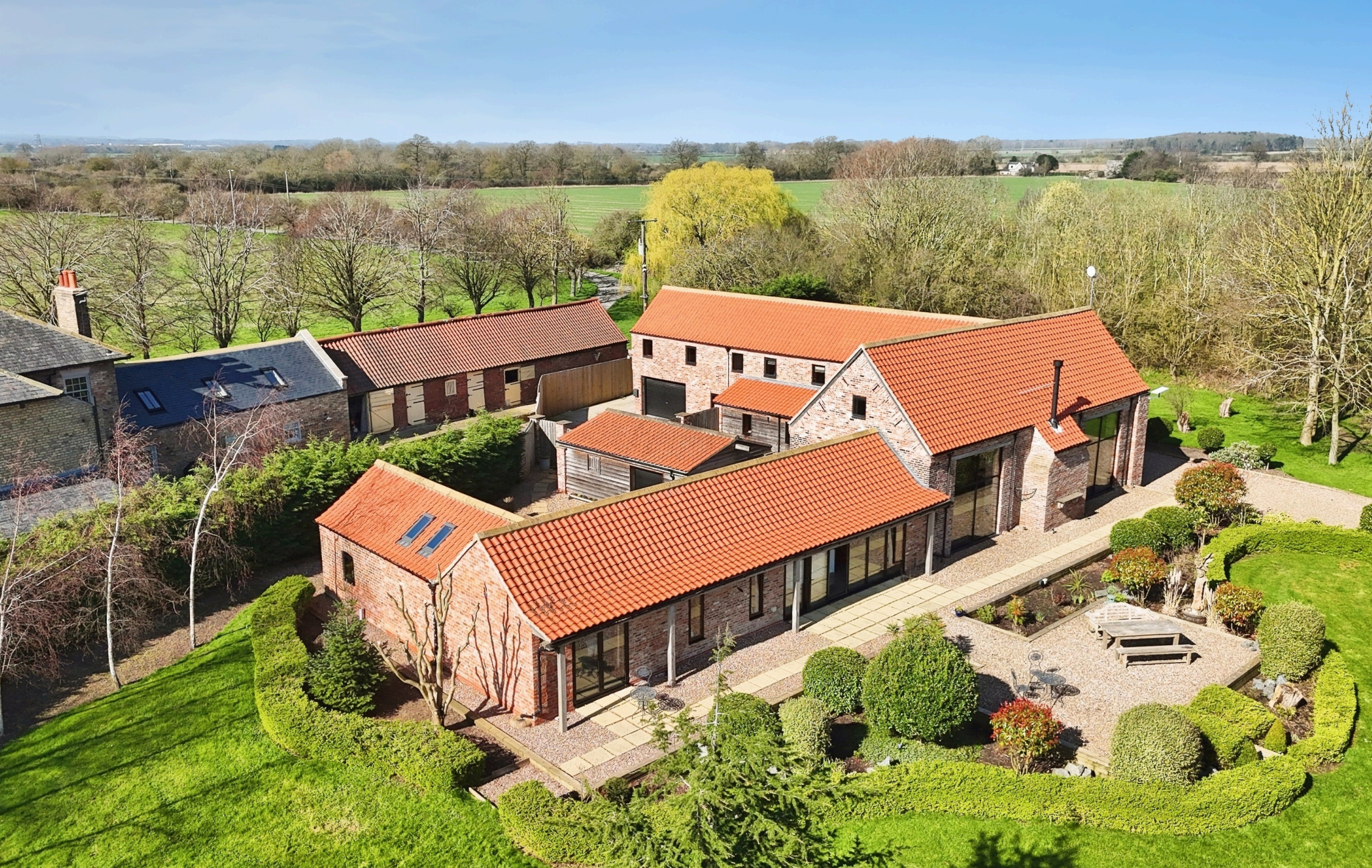
Lakefield Grange, Meaux, Beverley, East Riding of Yorkshire, HU17 9SS