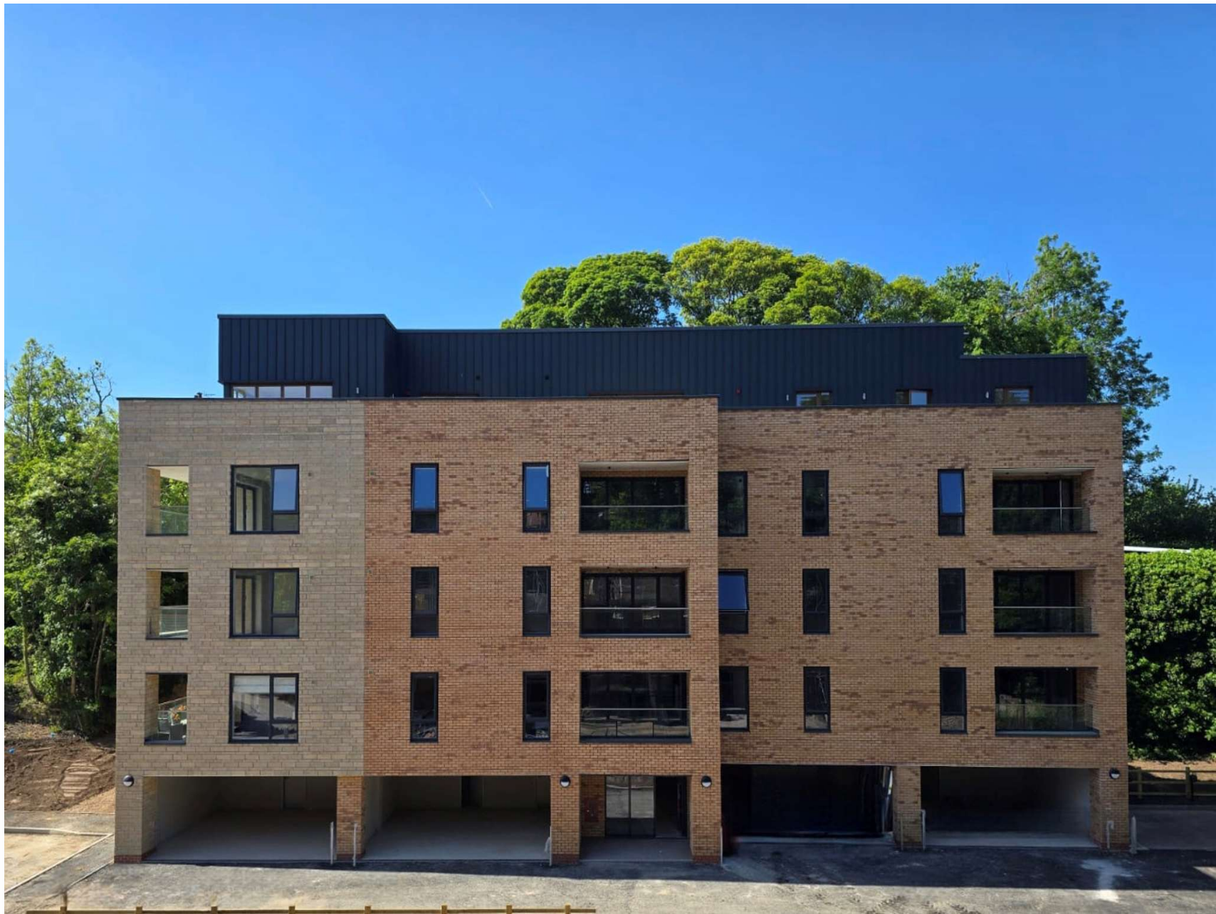
Mustard Mills Luxury Apartments Valley Lane, Mansfield NG18 2HT