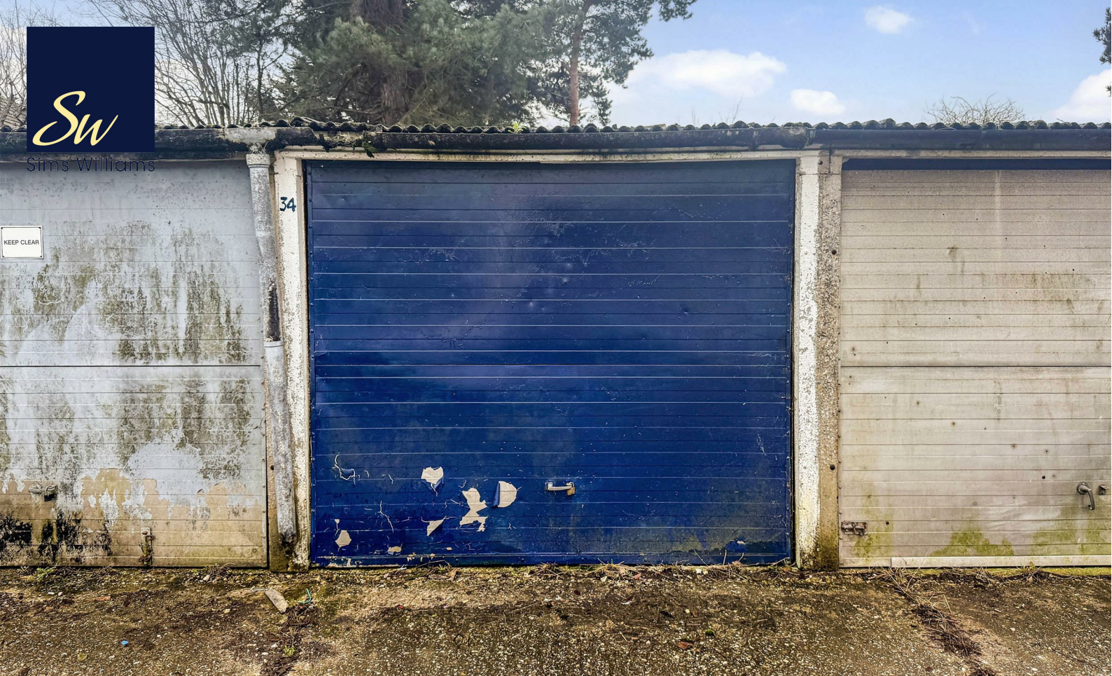
GARAGE 34, ELM ROAD, WESTERGATE, PO20 3RQ