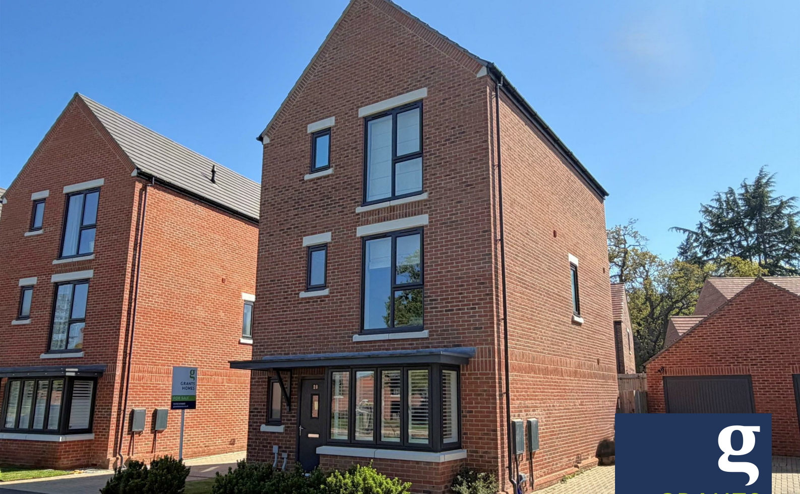
Nightingale Avenue, Ottershaw, KT16 0SA