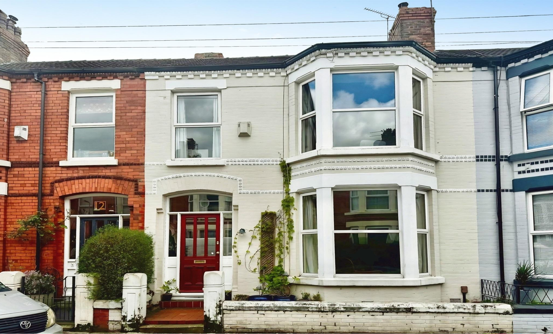
Bromley Avenue, Liverpool L18 1JF