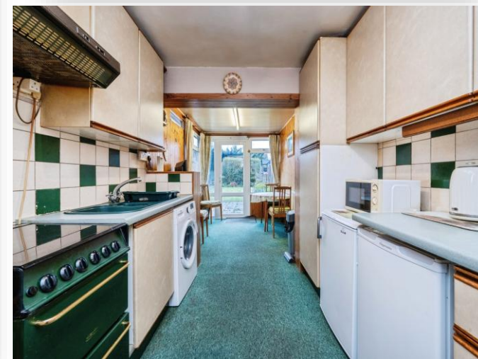
Crossway, Leighton Buzzard, LU7 3ND