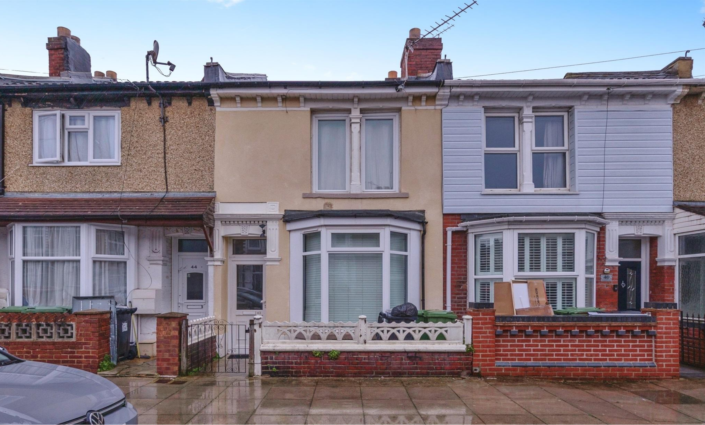
Bedhampton Road, Portsmouth PO2 7JY