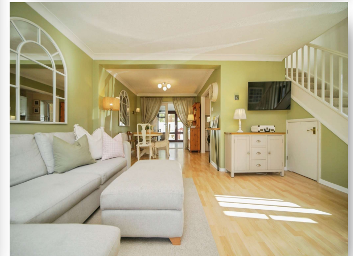
Spencer Way, Stowmarket IP14 1UB