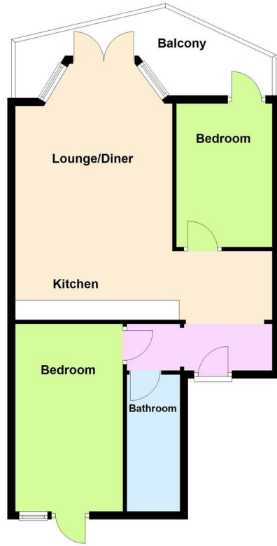
Total area: approx. 61.9 sq. metres (665.9 sq. feet)