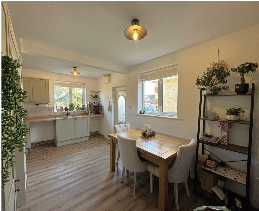
table and chairs, built-in cupboard into the alcove housing the gas combi boiler and a door leads through to the hallway with doors leading to all accommodation. The hall has loft access via a hatch with a pull down ladder and a rear aspect door leads out onto the Westerly facing enclosed garden.

The living room is adjacent to the kitchen/diner providing a cosy room with a rear aspect double glazed bay window enjoying far reaching countryside views. The master bedroom is a generous sized double boasting a rear aspect double glazed window enjoying far reaching countryside views. Bedroom two is a further double with a front aspect double glazed window. The modern style bathroom suite comprises a corner bath with shower attachment over and screen attached, low level WC, wash hand basin, wall mounted towel rail heater, feature exposed brick walls and a front aspect double glazed window.