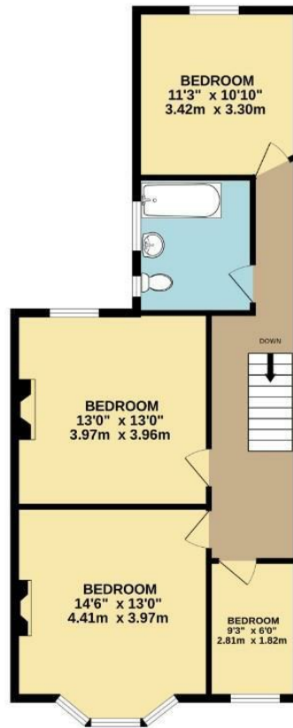
1ST FLOOR 713 sq.ft. (66.3 sq.m.) approx.