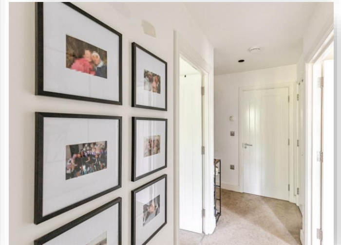
Freemans Court Station Road, Rushden NN10 9FS