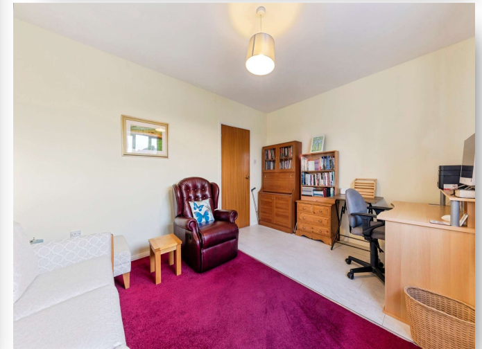
Boundary Court Boundary Road, Newark NG24 4EA