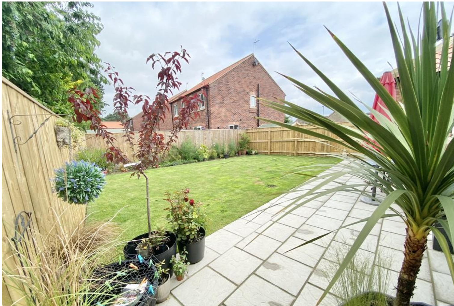
Patio and Garden