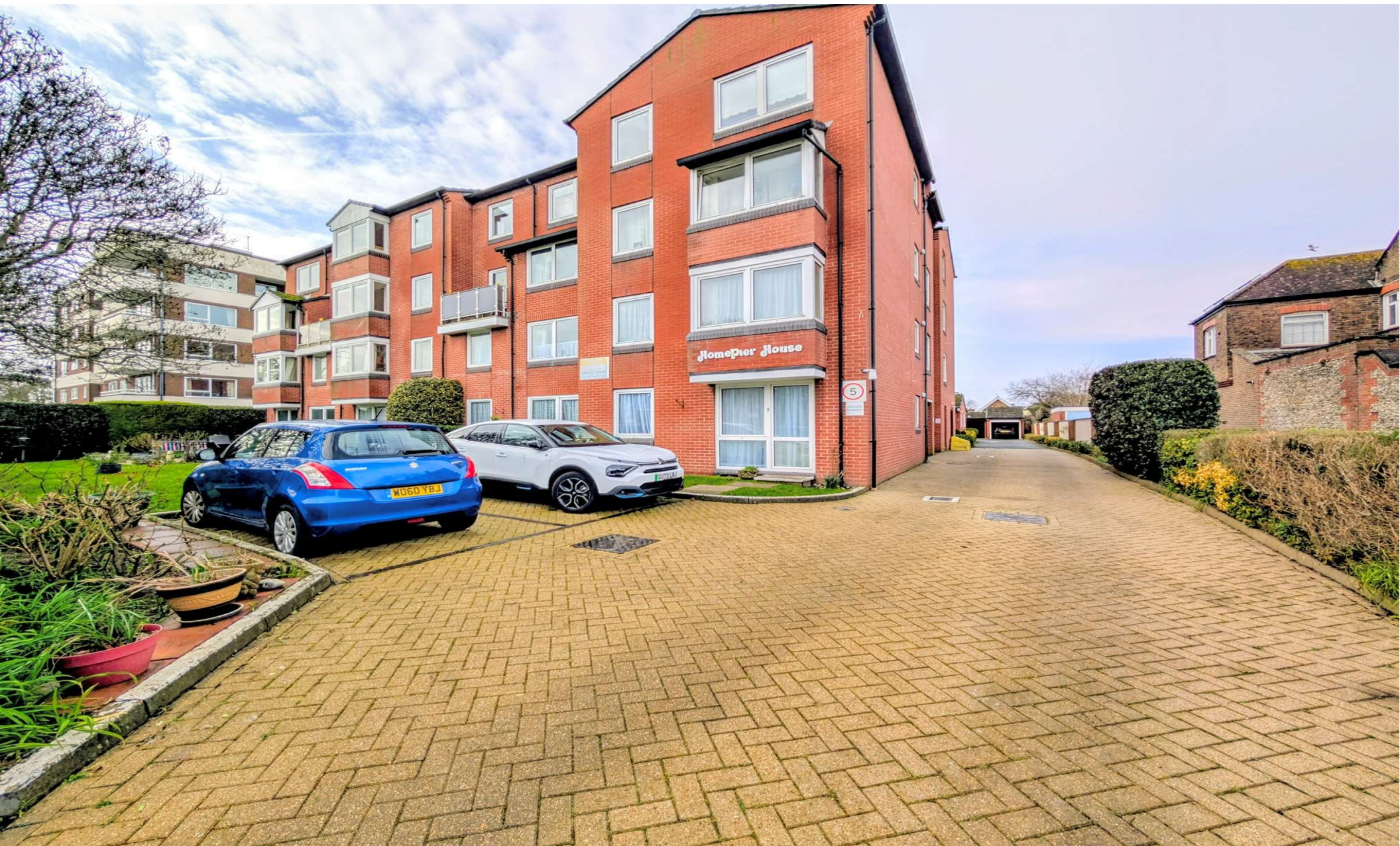
Homepier House Heene Road, Worthing BN11 4PP