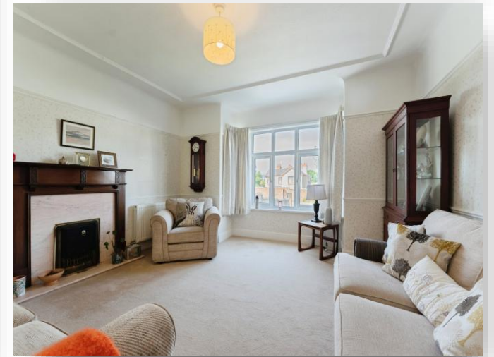
Ravenswood Avenue, Rock Ferry, Birkenhead CH42 4NX