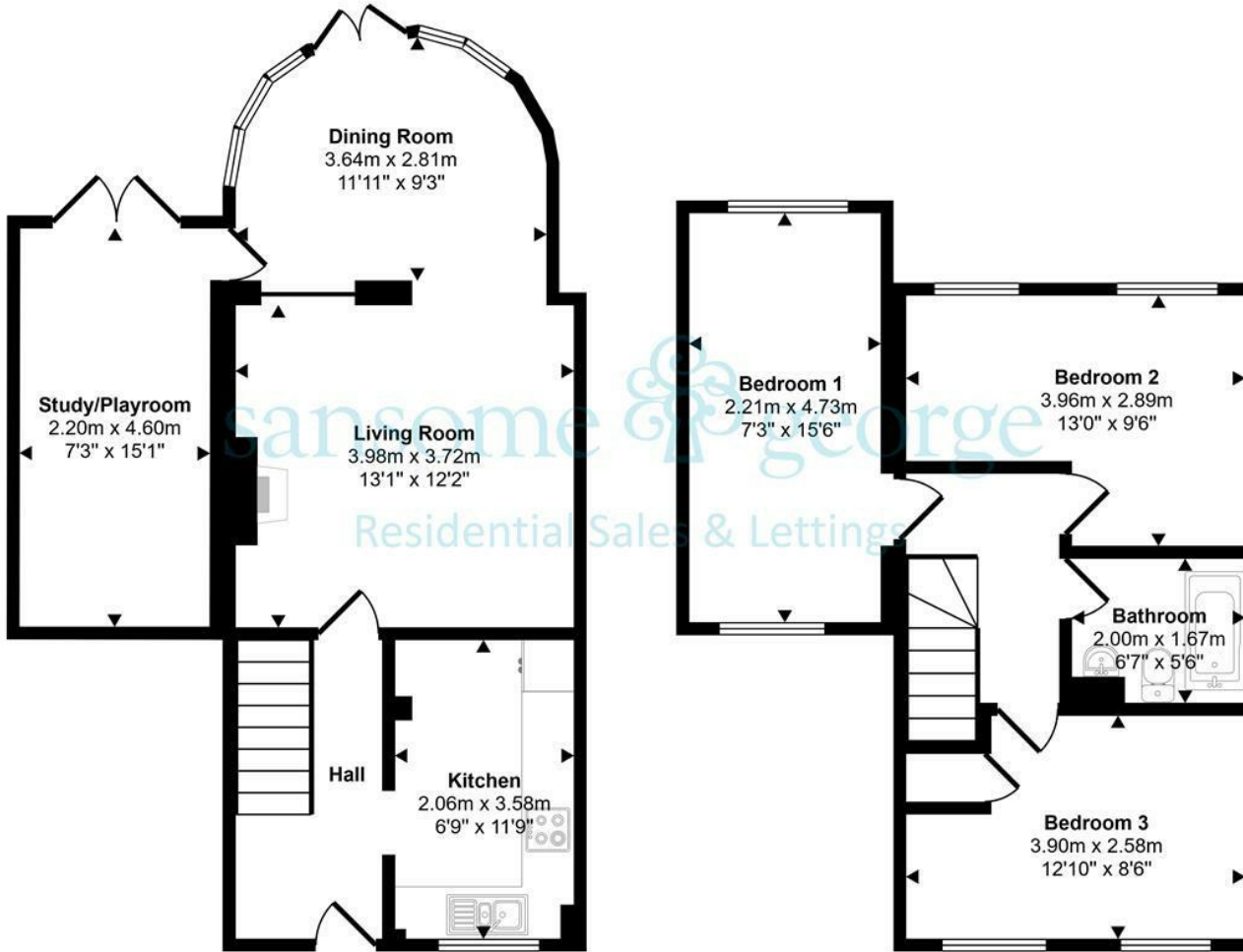
Ground Floor Approx 50 sq m / 543 sq ft

Approx Gross Internal Area 91 sq m / 981 sq ft