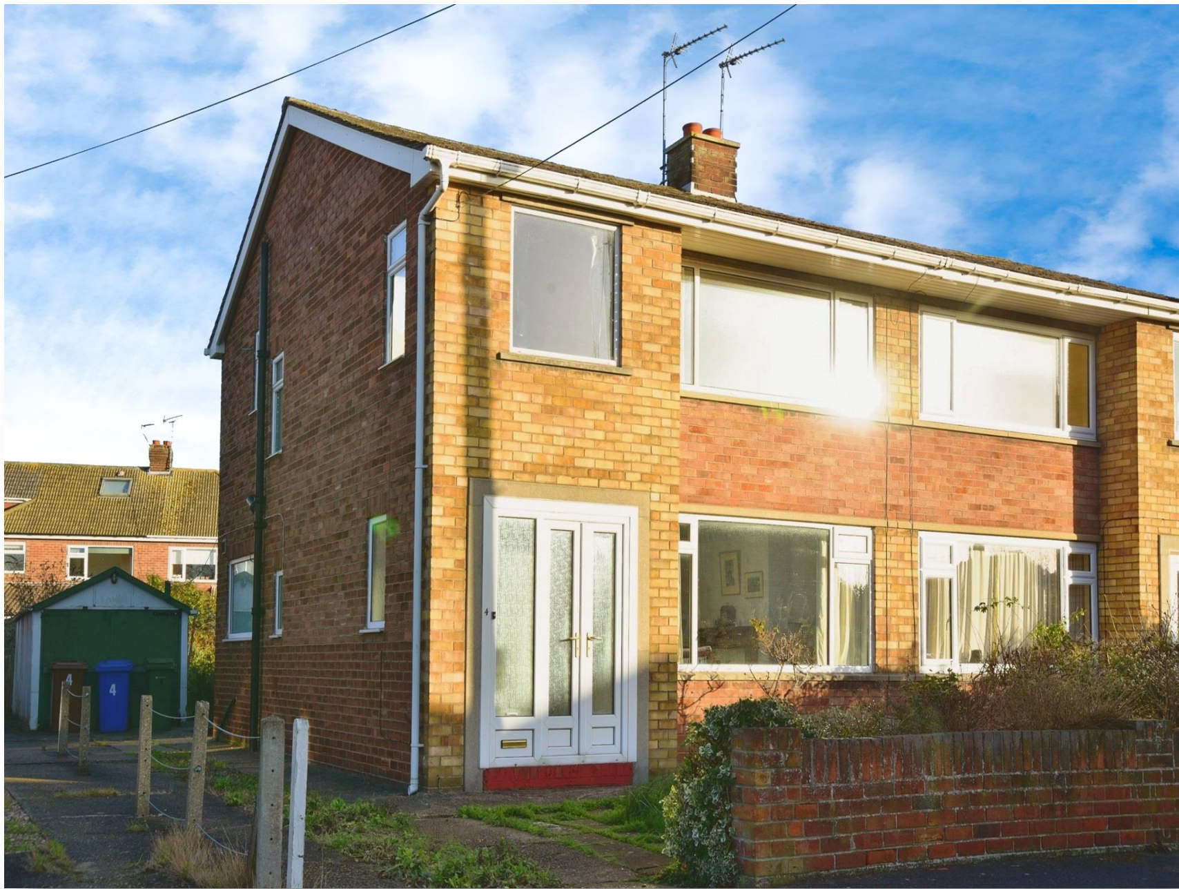
West Close, Beverley, HU17 7JJ