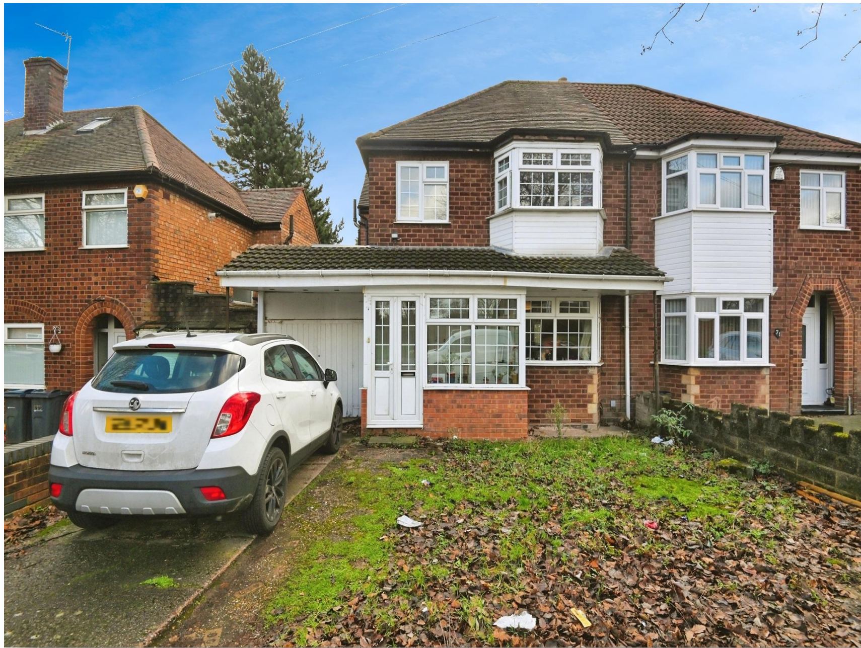
Kempson Road, Hodge Hill Birmingham B36 8LR