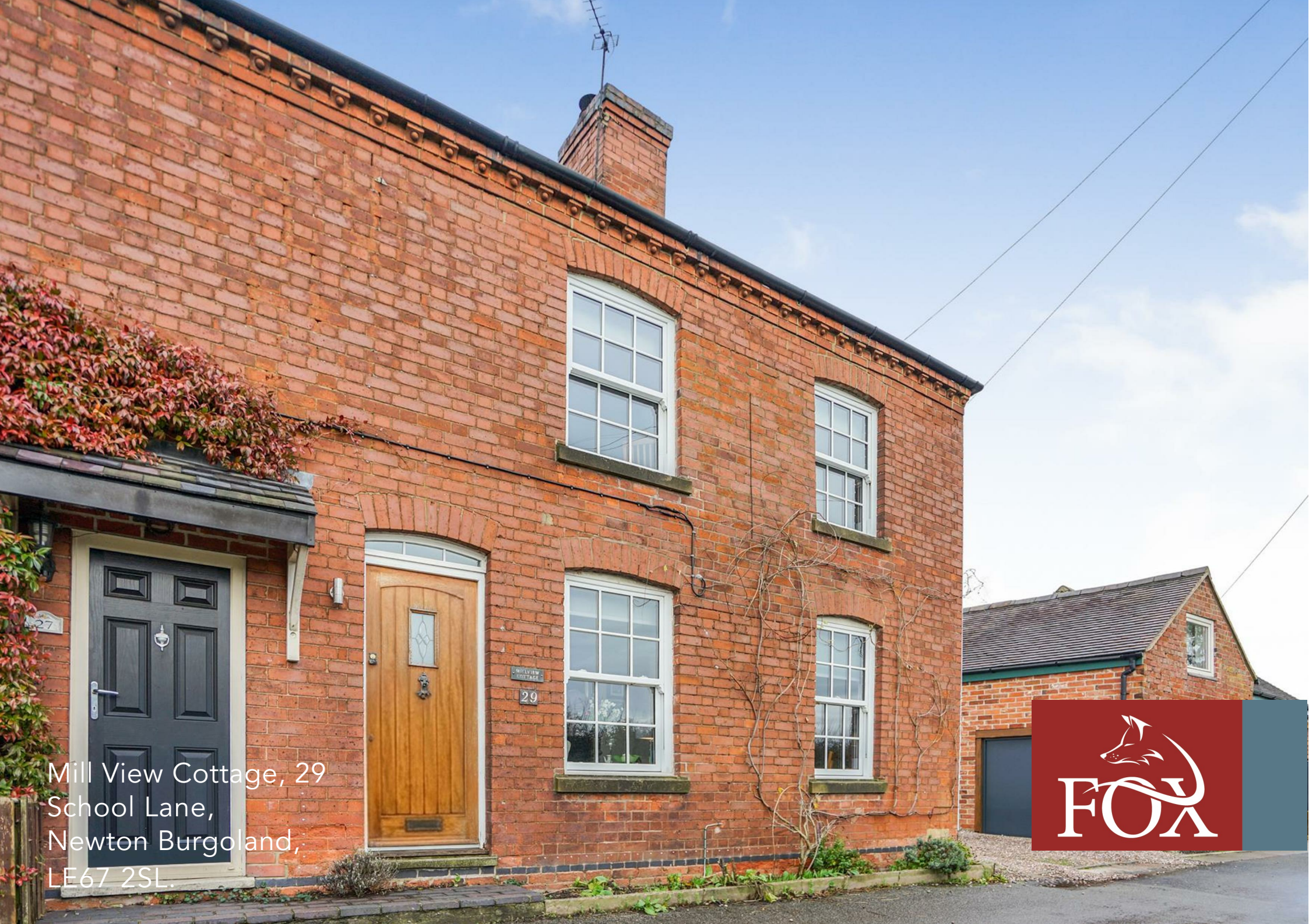
Mill View Cottage, 29 School Lane, Newton Burgoland, LE67 2SL.