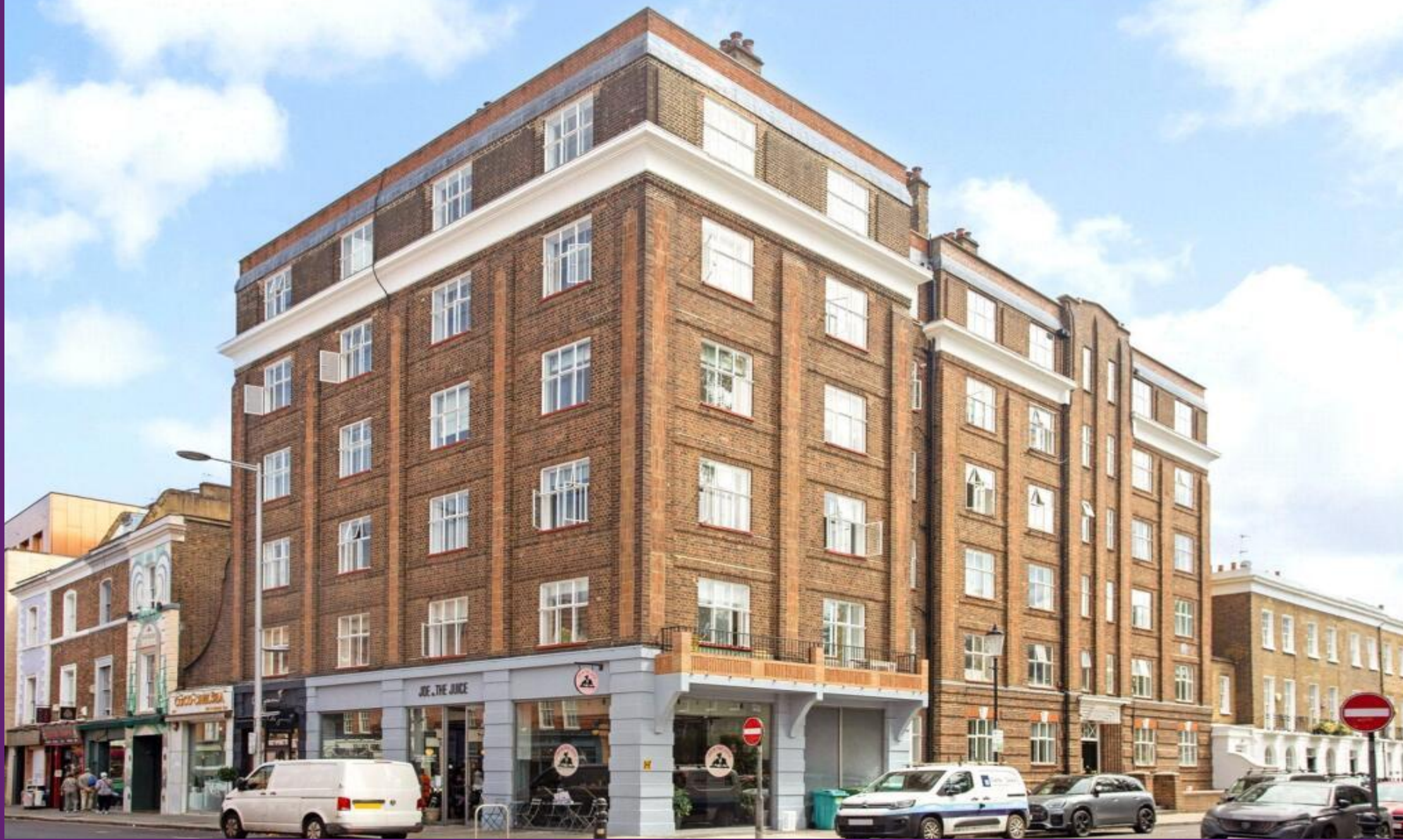
Paultons House Chelsea, SW3