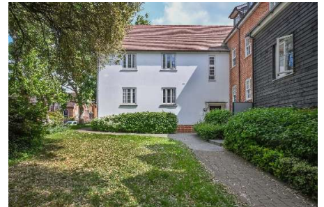
Chelmsford Guide Price £240,000 - £250,000 2-bed first floor apartment