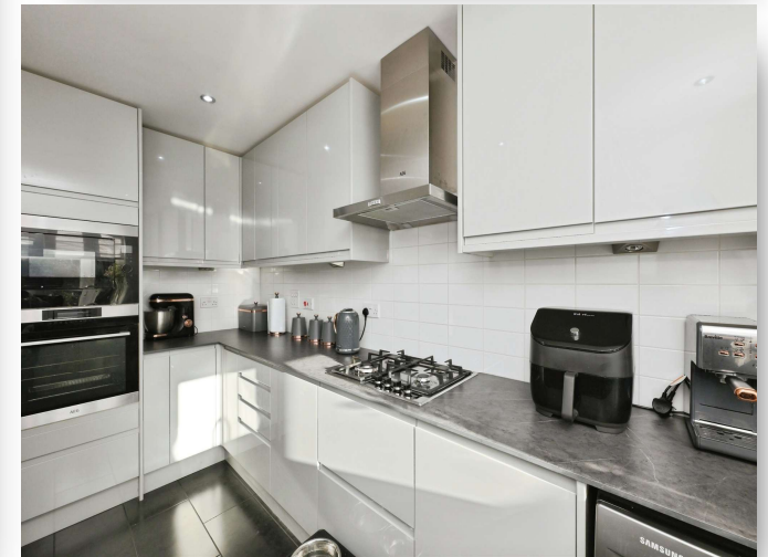
Robinia Road, Broxbourne EN10 6GE