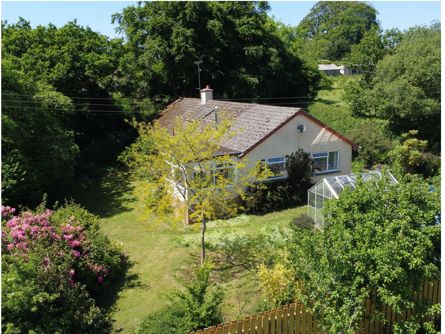
Lower Bealy Court Orchard