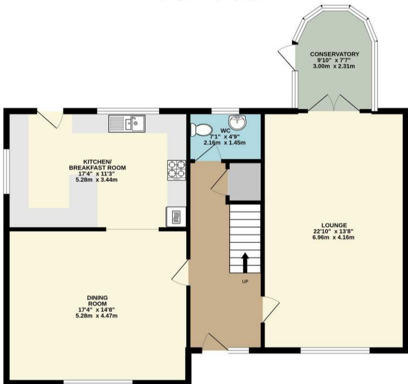
GROUND FLOOR 992 sq.ft. (92.2 sq.m.) approx.