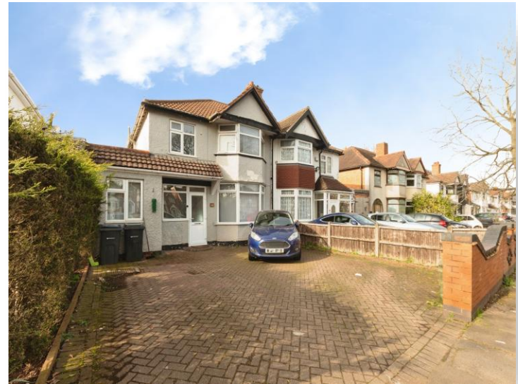
Fox Hollies Road, Hall Green Birmingham B28 8RJ