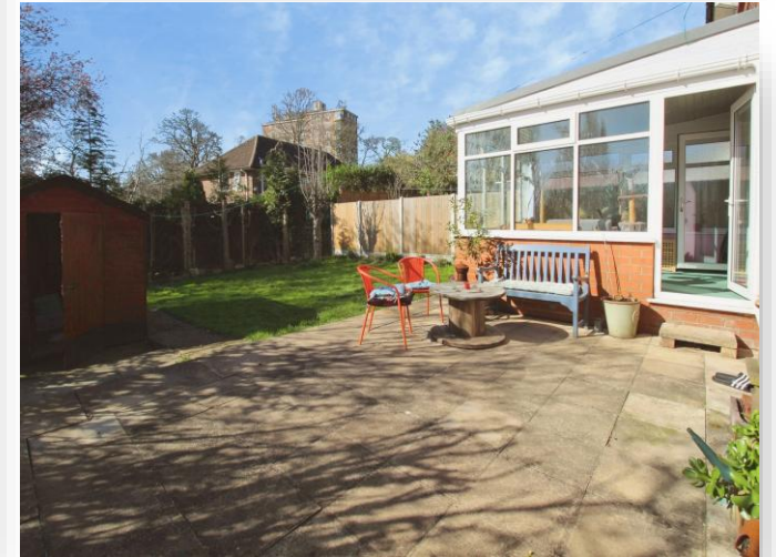
Queenswood Close, Leeds LS6 3LZ