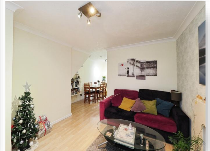
Ravensthorpe Drive, Loughborough