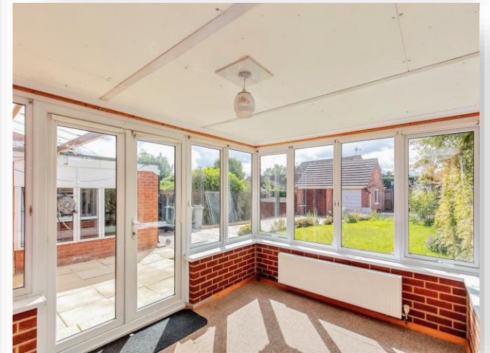
Masefield Road, Kettering NN16 9LE