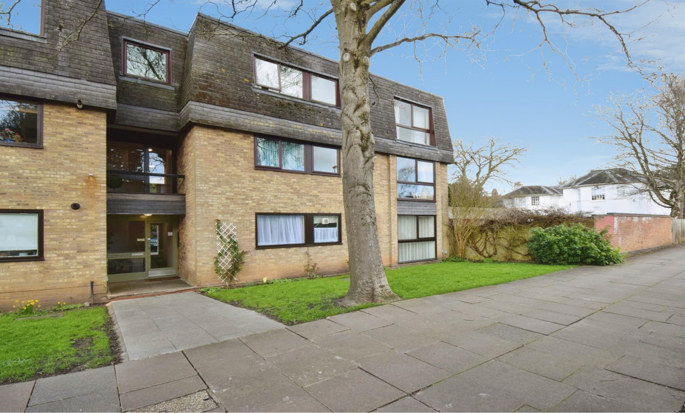
The Sycamores North Avenue, Leicester LE2 1TL

Not for marketing purposes INTERNAL USE ONLY