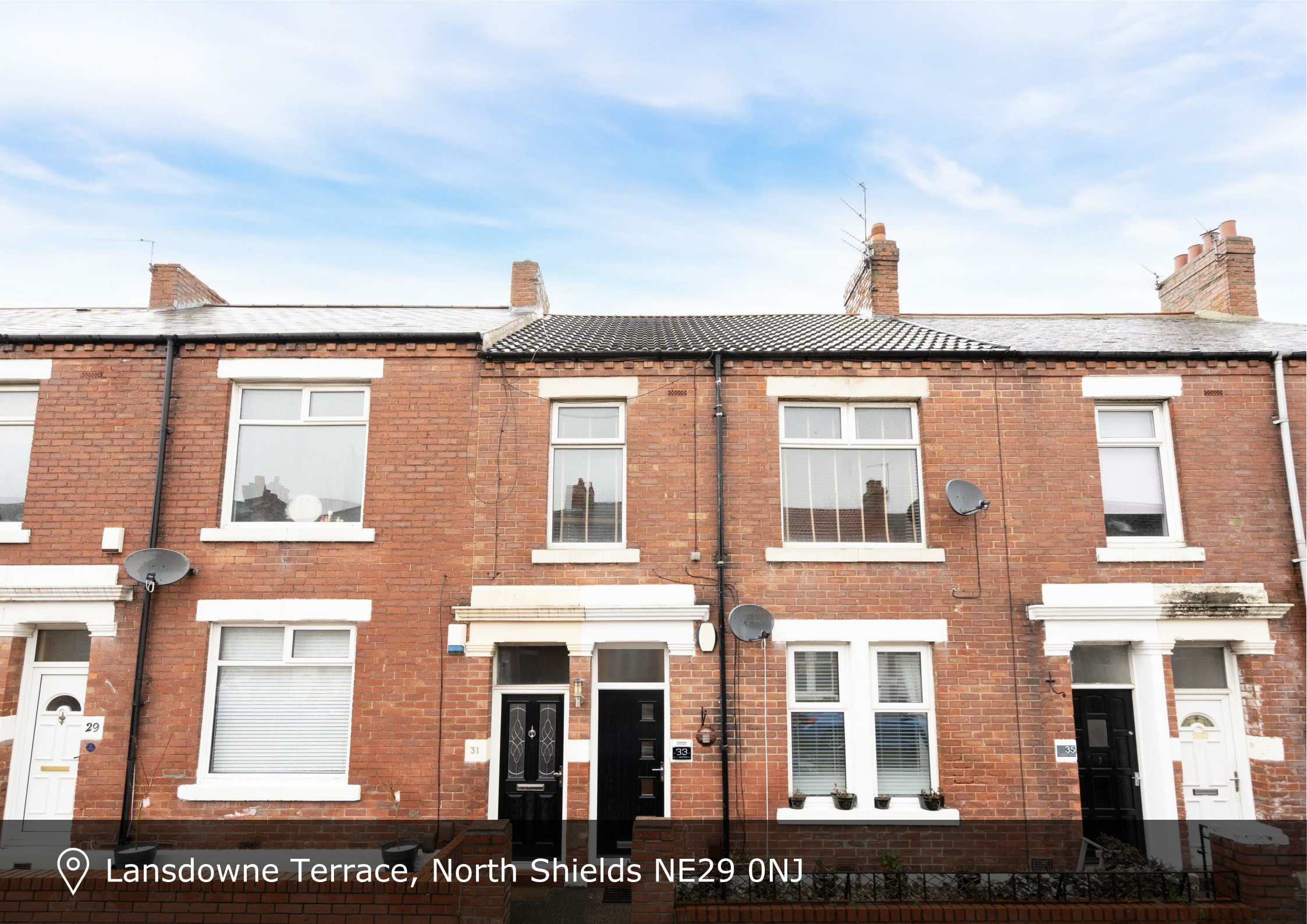
📍 Lansdowne Terrace, North Shields NE29 0NJ