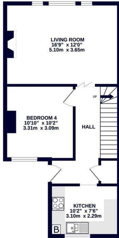
1ST FLOOR 487 sq.ft. (45.2 sq.m.) approx.