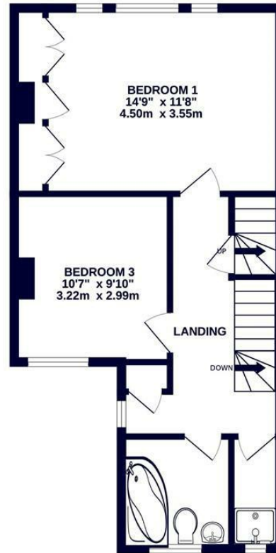
2ND FLOOR 483 sq.ft. (44.9 sq.m.) approx.