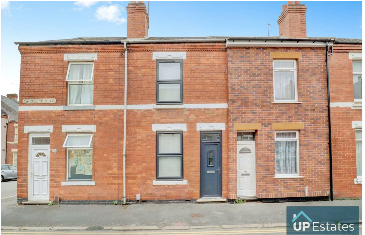
Carmelite Road, Coventry