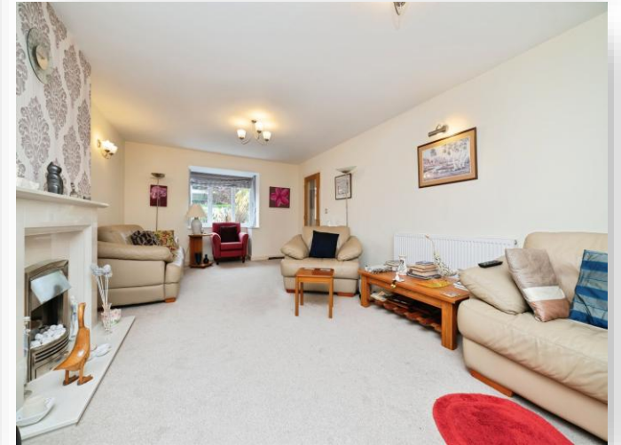
Harley House, Elmswood, Hesse HU13 0NU