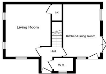
Ground Floor Floor area 39.9 sq.m. (429 sq.ft.)