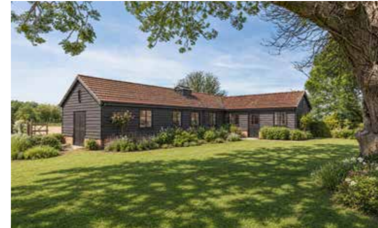
AI enhanced image showing potential conversion of outbuilding

“...a redundant outbuilding offers exciting long term potential, as guest accommodation, a home office, gym or creative studio space.”