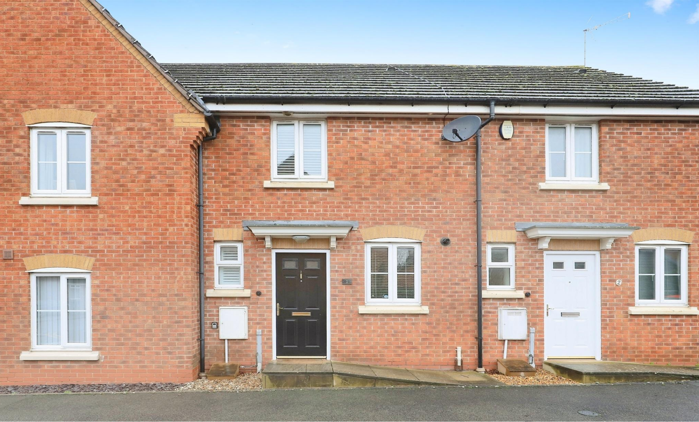
Scholars Court, Kidderminster DY10 1PJ