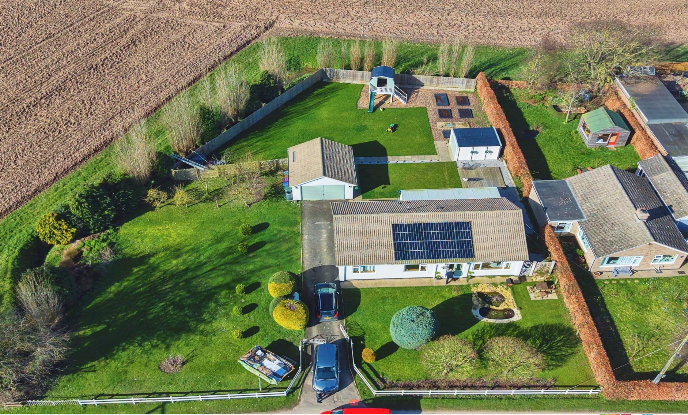
The Mallard Marsh Road, Kirton BOSTON PE20 1LY