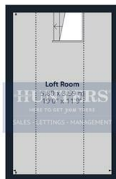
Floor 3 Building 1