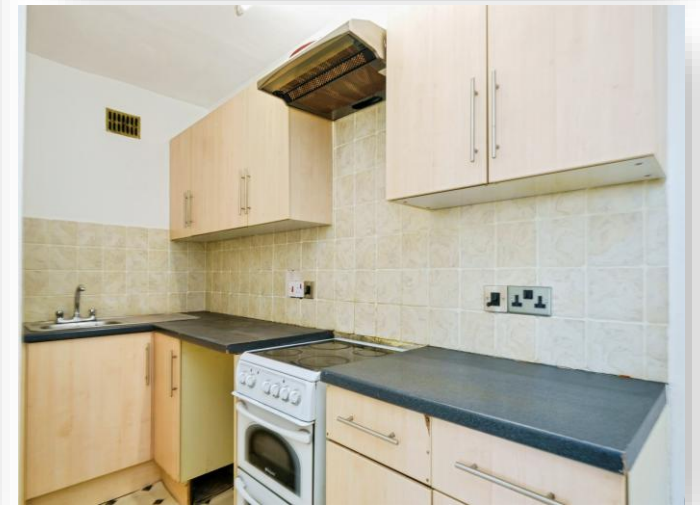
Portland Court, Wellington Road, Wallasey, CH45 2NQ