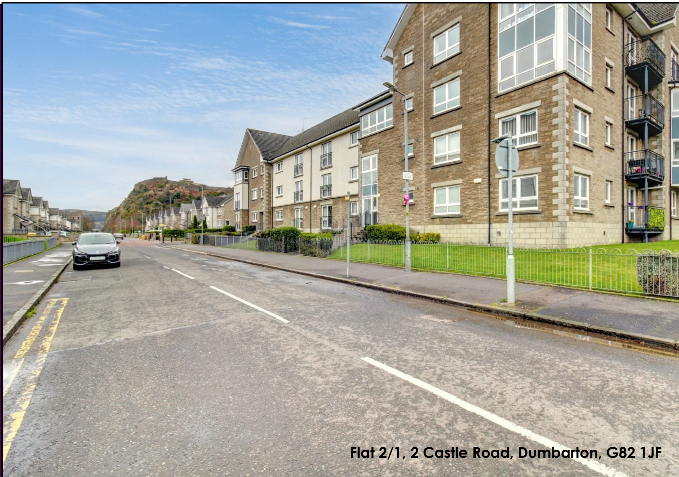
Flat 2/1, 2 Castle Road, Dumbarton, G82 1JF

Offered to the market in pristine, walk-in condition, this luxurious modern two-bedroom second-floor apartment forms part of the highly regarded Castle Point development, built by the renowned Turnberry Homes.