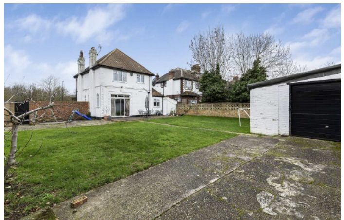
Sidcup Road, SE12