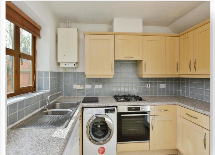
Benacre Croft, Tattenhoe Milton Keynes MK4 3FG